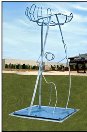
"Aspire and Become"

1965-1970 - Protestant School Board of Greater Montreal